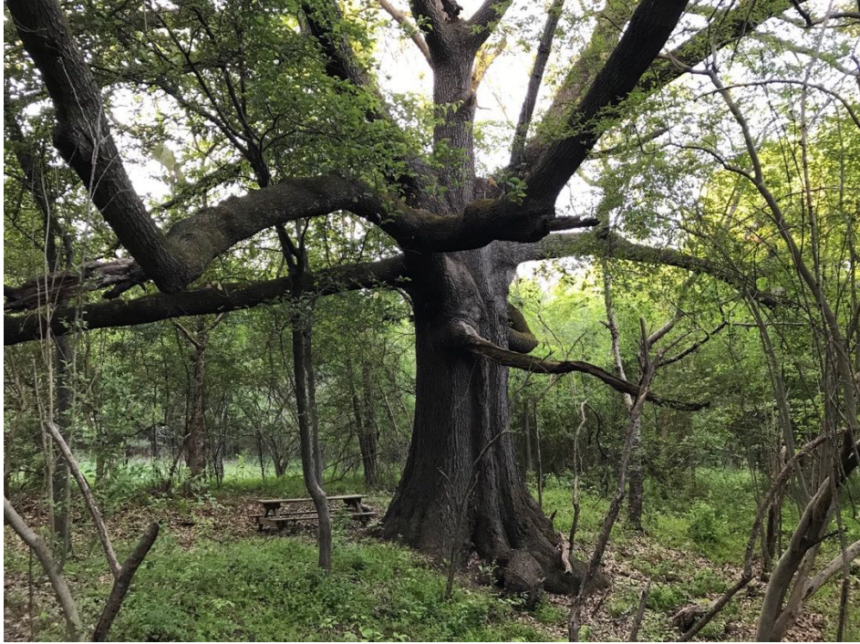
Oak tree next to picnic bench.