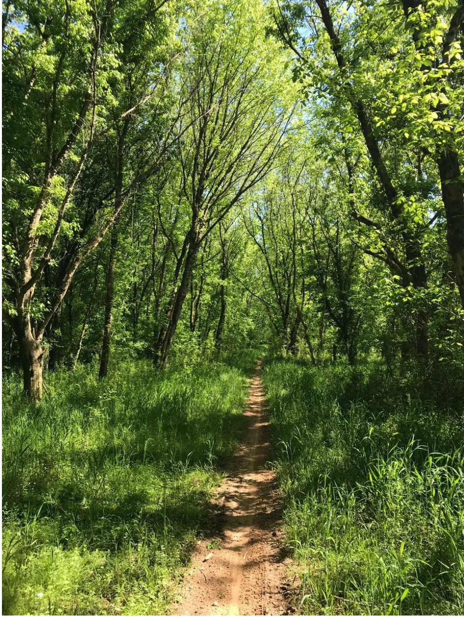
Hiking and cycling trail through boxwoods.