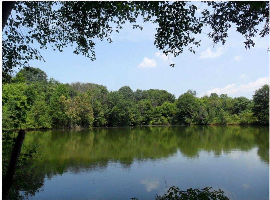
Lake that's no longer accessible for public use.